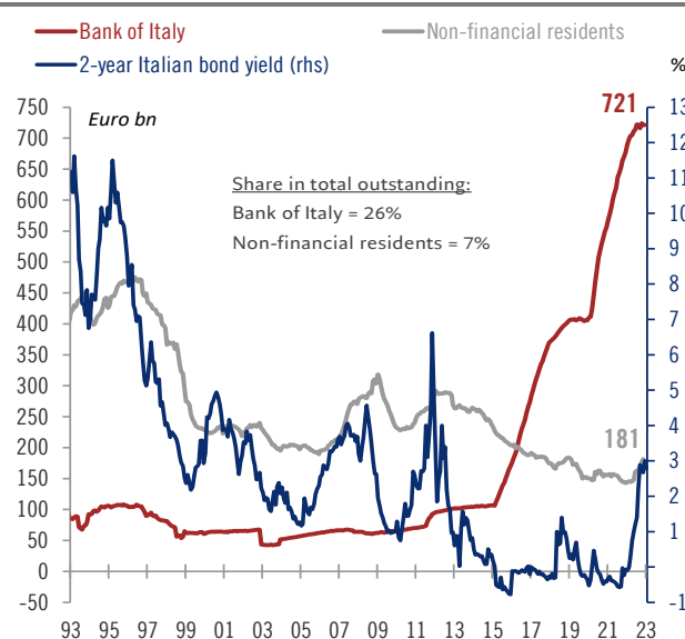
Chart 3: Amount of Italian sovereign debt held and the two-year bond yield

Source: Pictet Wealth Management, DataStream, December 2022